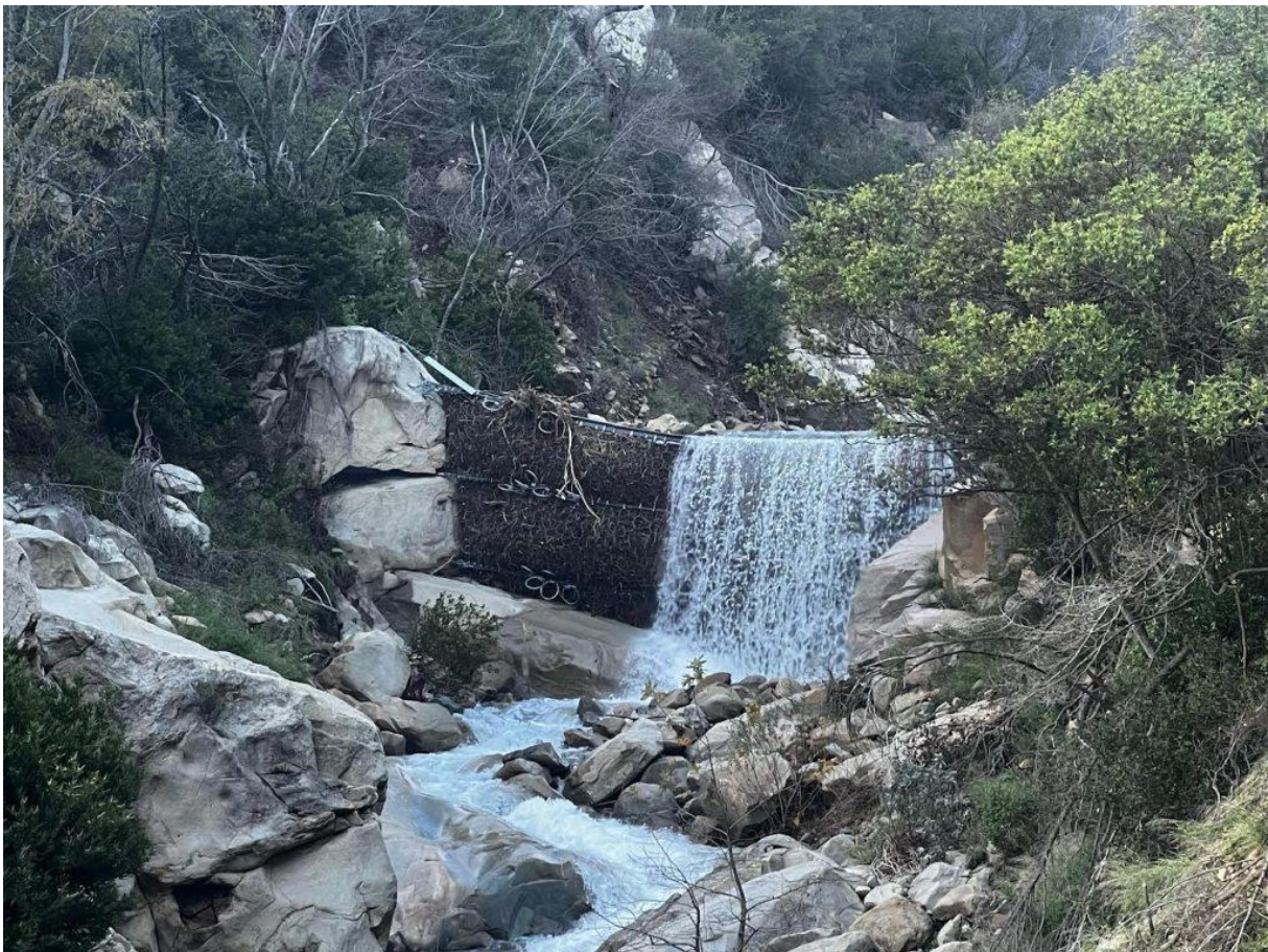
The debris net on Upper San Ysidro Creek seen Wednesday. The net is at least 25 feet high and is packed with debris after this week's storms.

He's a former Santa Barbara city fire chief and executive director for the Project for Resilient Communities , the nonprofit group that formed and raised funds for the nets following the deadly and destructive Jan. 9, 2018, debris flows in Montecito.